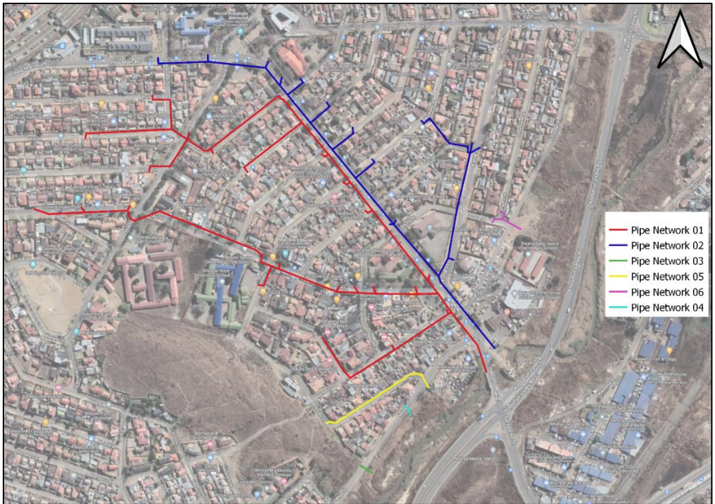
Figure 2-1: Model of Existing SW Pipe Networks in the Precinct The scope of work shall include but not be limited to the following:

The project scope will focus on Vilakazi Street and Khumalo/main road to be surveyed for assessing the existing underground utilities.