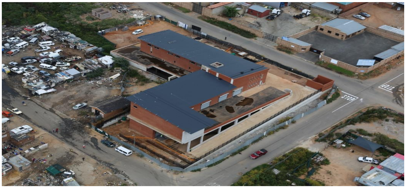
Alexandra Automotive Industrial Park, corner 4th Street and 2nd Avenue, Marlboro, Sandton