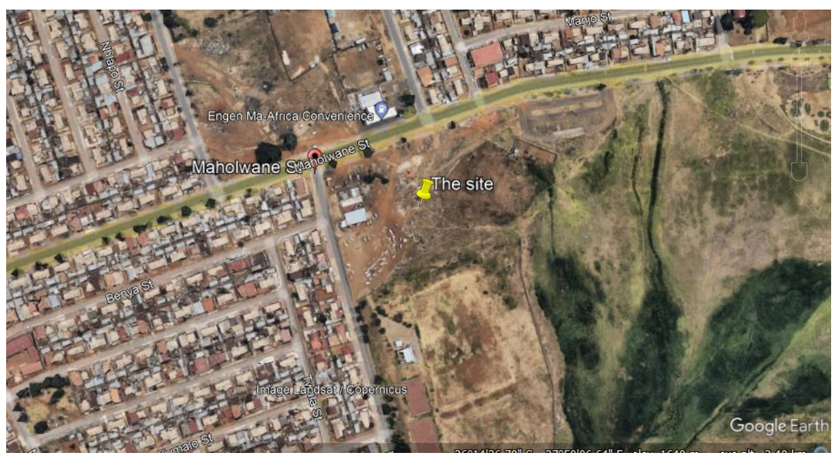
Figure 1: Site Map