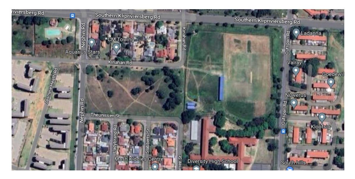
Figure 2: South Hills Clinic development site