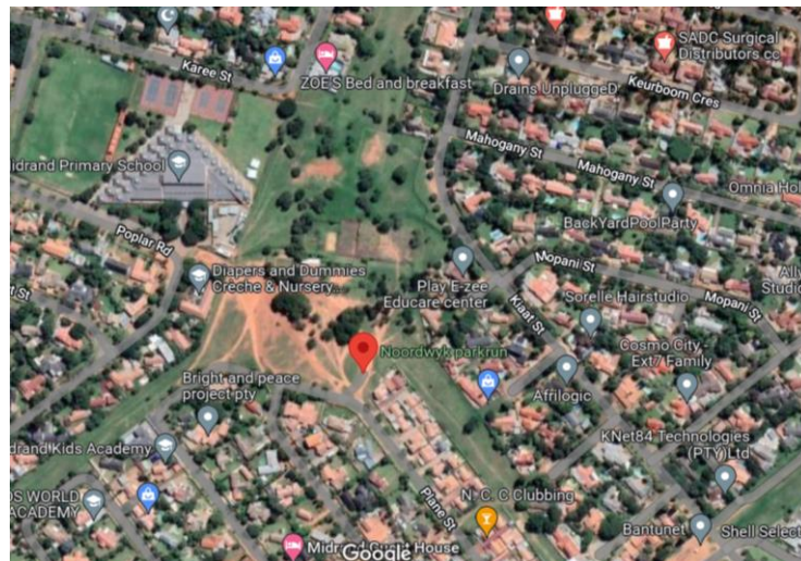
Figure 6: Noordwyk Park (Sports Ground) Map