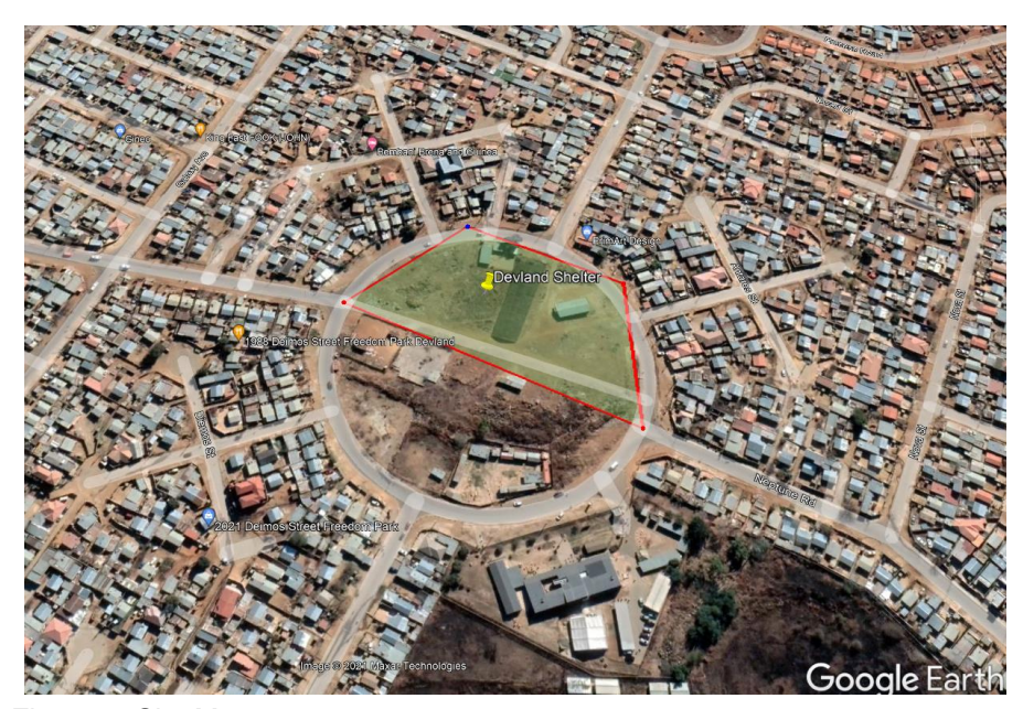
Figure 4: Site Map