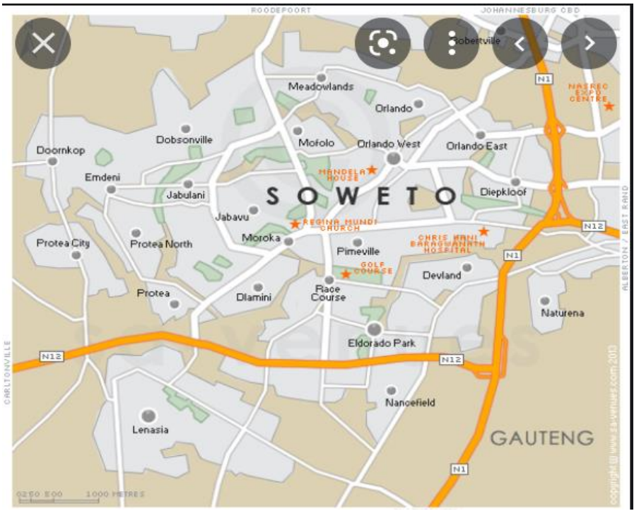
Figure 3: Soweto Map

Site Coordinatees (Coordinates: 26°17'46.66"S, 27°56'1.46"E)