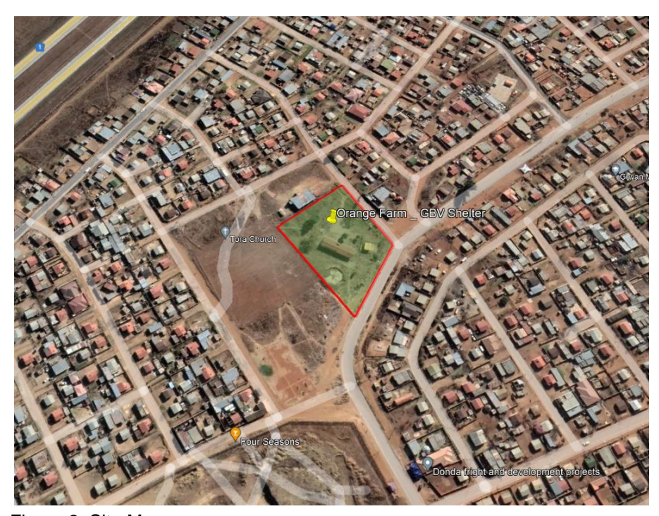
Figure 2: Site Map