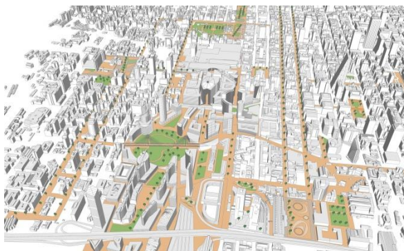
Inner city 2040

The roadmap is the framework through which the City and multiple stakeholders can collectively pursue the vision of the inner city as A place of opportunity: a well-governed, transformed, safe, clean and sustainable inner city of Johannesburg, which offers high quality, sustainable services; supports vibrant economic activity; and provides a