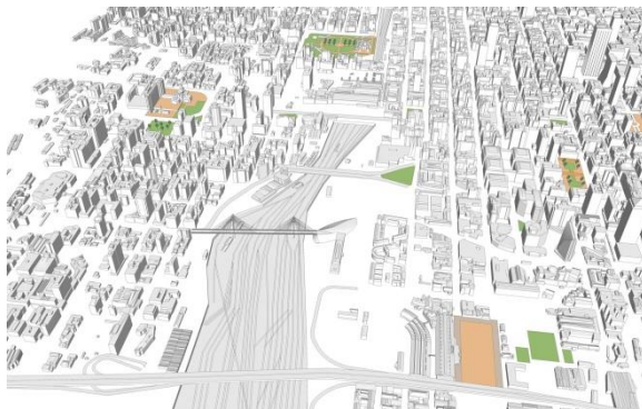
Inner City 2012

The City's stated intention is to deliver, extend and maintain services that are sustainable in the long term; to provide the social support and facilities that promote inclusivity and diversity; and to encourage productivity and the economic endeavours of large and small business. This can only be achieved with good governance and strategic planning and budgeting. It can only be sustained with dedicated effort to maintain and repair the infrastructure that is the backbone of the built environment. And it is best achieved within neighbourhoods – a planning and implementation system that is focused on delivery and maintenance at the local scale. This area-based focus is essential if we are to tackle issues in the inner city in a holistic way.