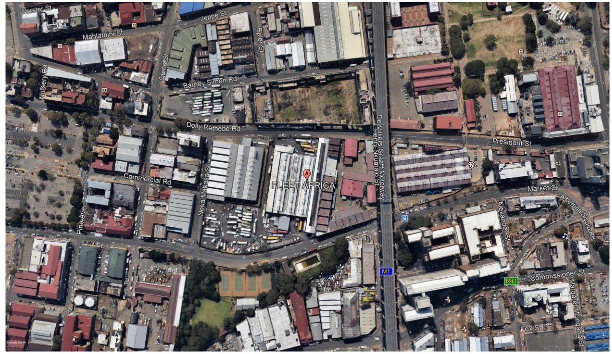
Figure 1: Fleet Africa Bus Holding Facility

The refurbishment of ranks will be for all the Inner City Local and Long-Distance Bus Holding, including cross boarder commuting. There are numerous ranks identified as a start for implementation. For purposes of this RFQ, Fleet Africa Cross Boarder Bussing (cnr Henry Nxumalo and Albertina Sisulu Str) is the study area.