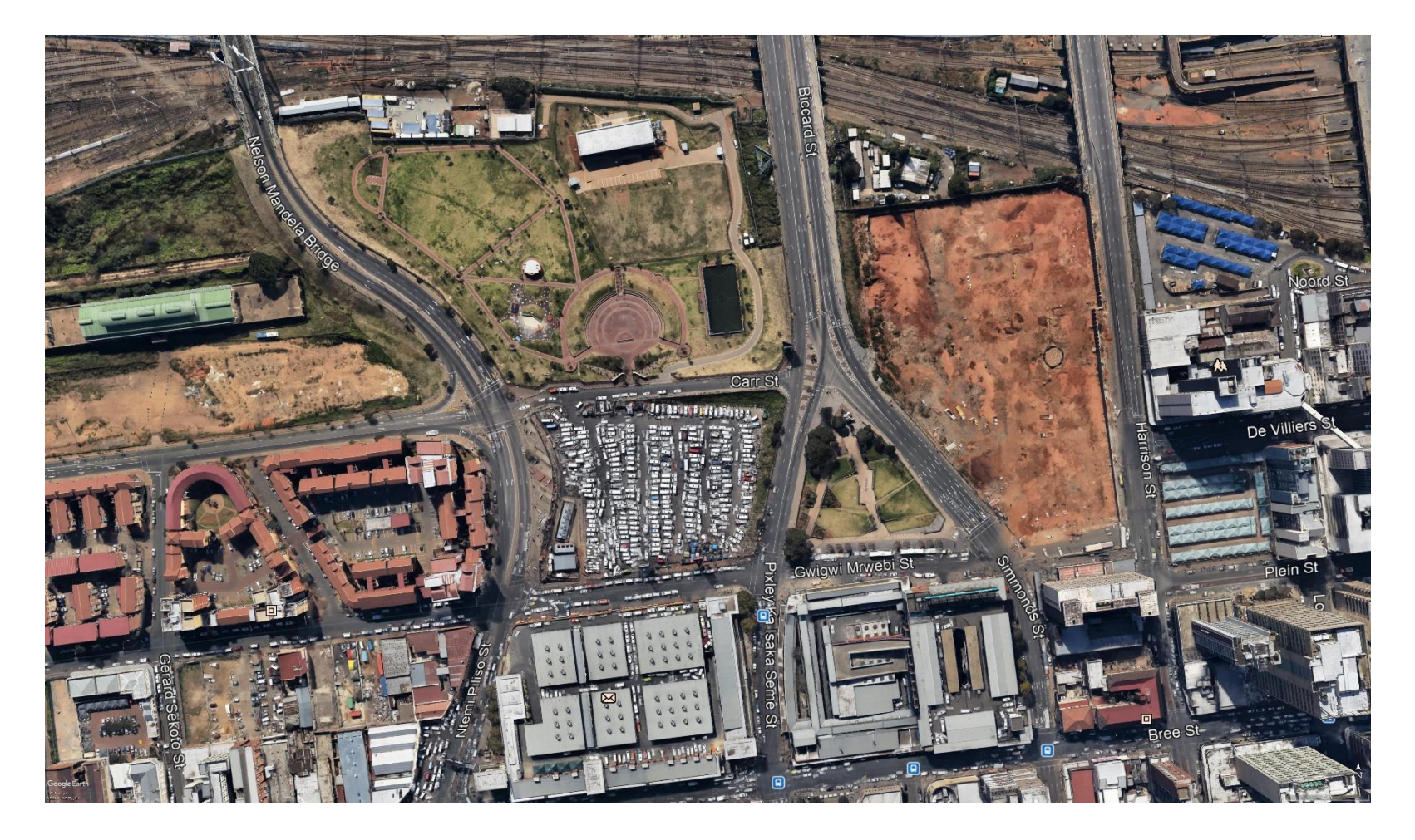
Figure 1: Carr Street Taxi Ranks