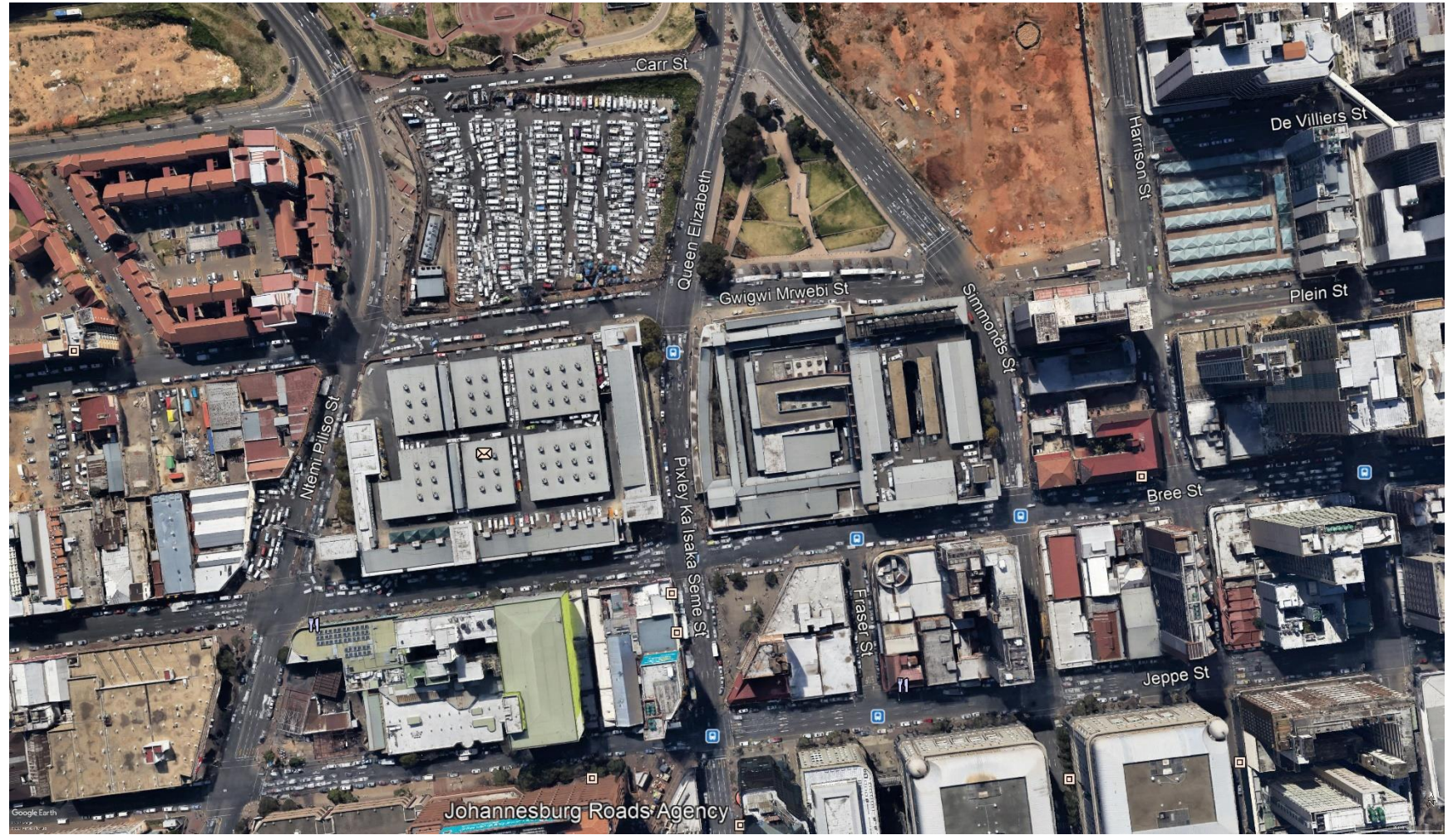
Figure 4: Metro Mall