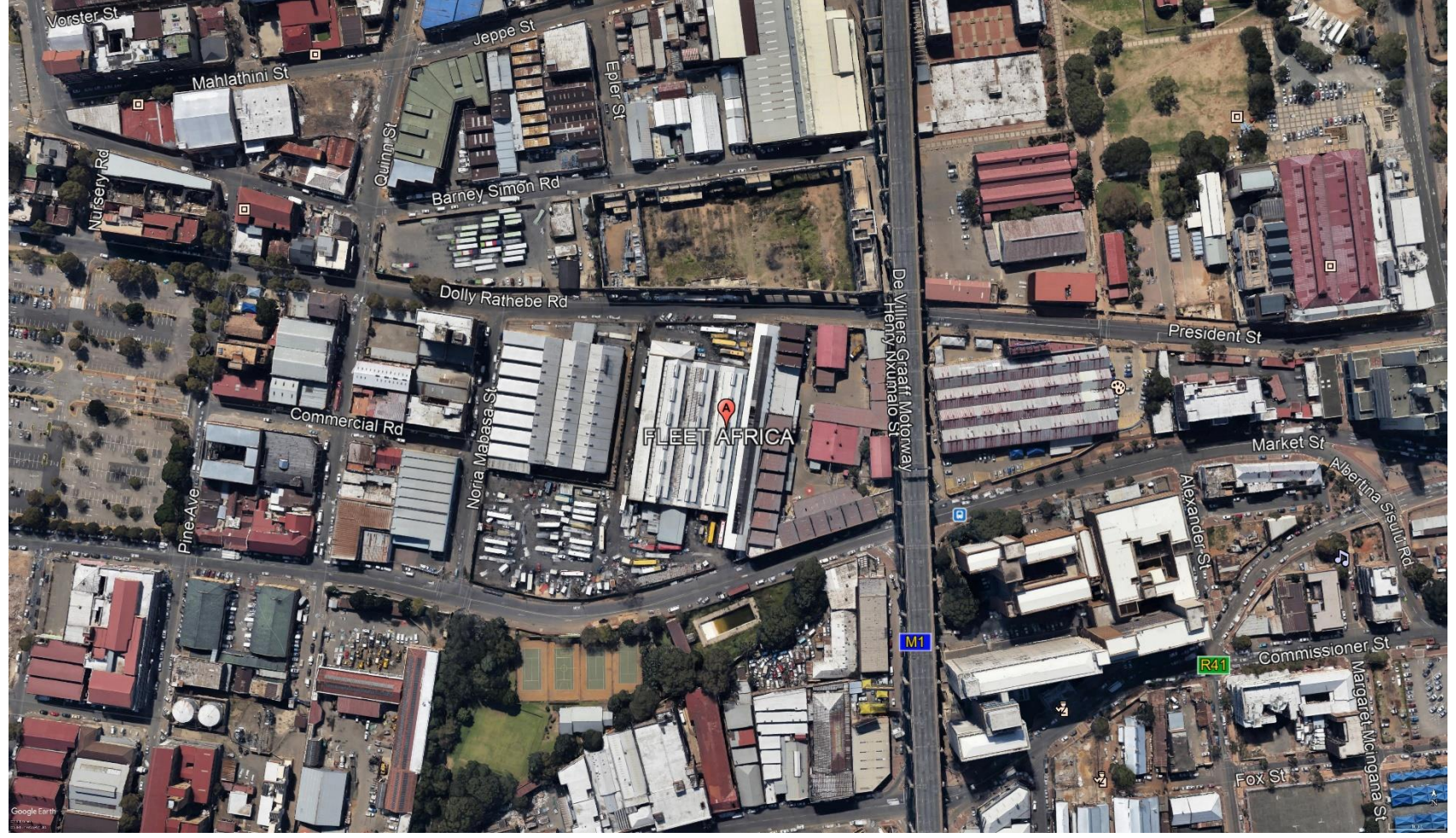
Figure 3: Fleet Africa PTF