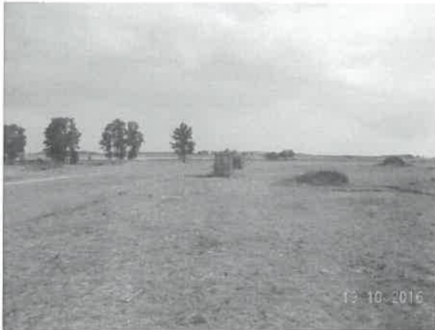
Figure 7: A picture of the undeveloped site