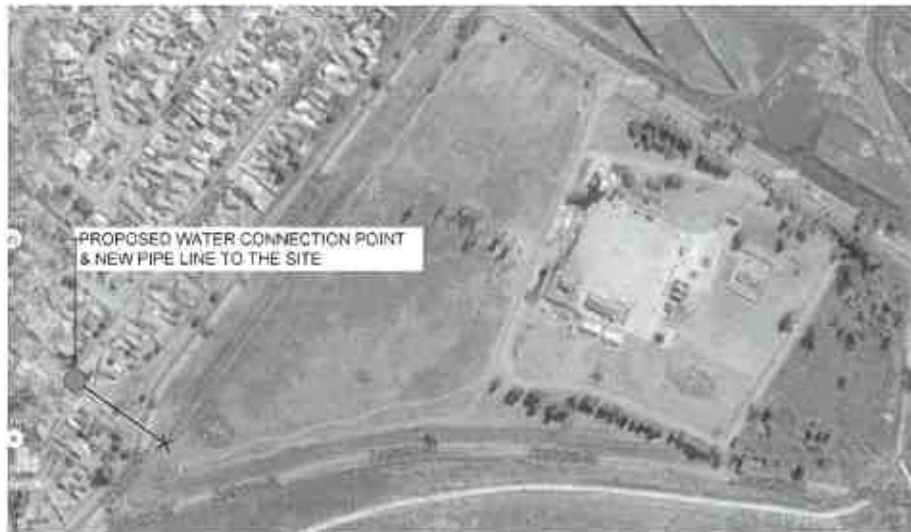
Figure 5: Proposed Water Connection Point

The internal water reticulation network will also require upgrading to comply with the dolomitic risk standards.