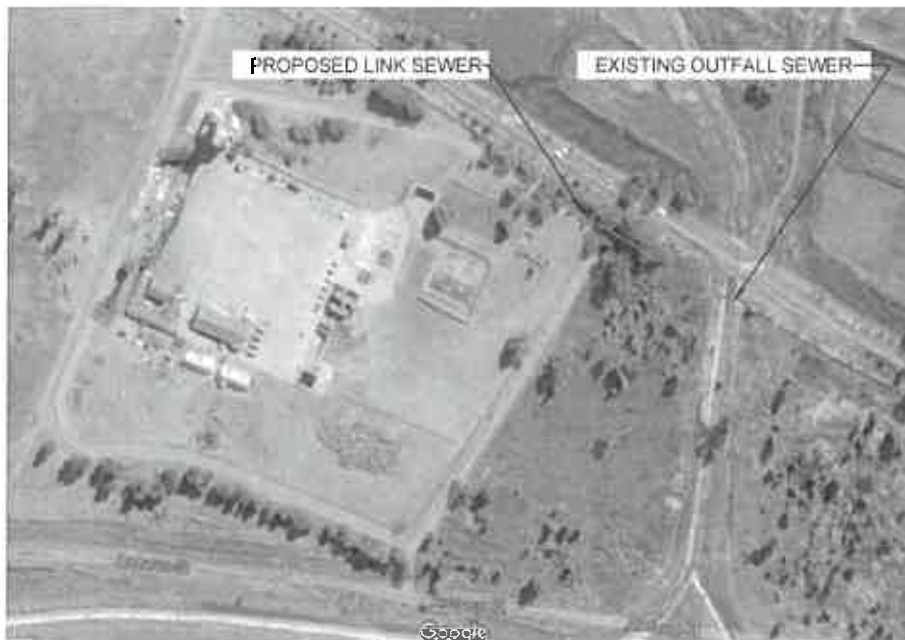
Figure 6: Proposed Sewer Connection