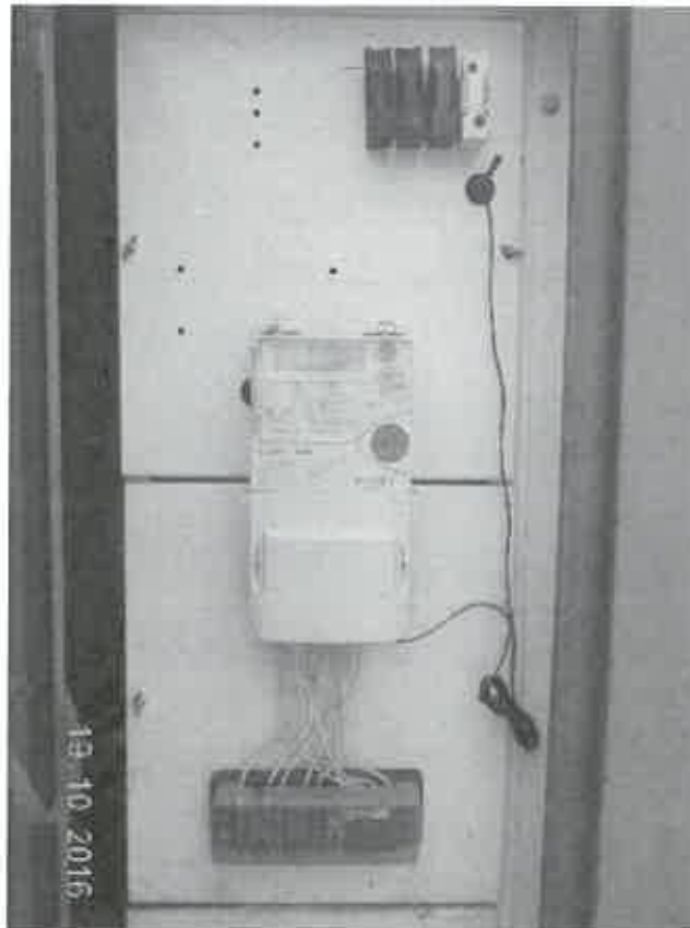
Figure 9: Current Meter