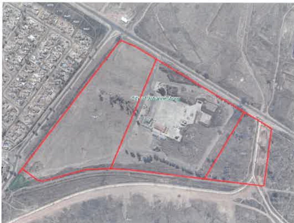
Figure 2: Aerial view of the site

The site consist of an existing training academy with a small fire station. In the aerial view included as Figure 1 it can be seen that the site consists of a number of existing buildings, a large concrete pavement area, a training tower building and two water reservoirs. The remainder of the site a mainly grass covered open area. The site slopes gently in a north-eastern direction.