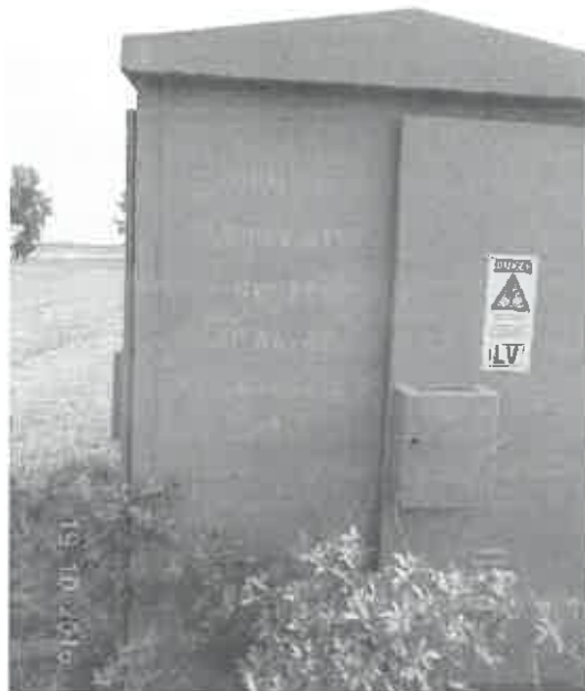
Figure 8: Current electrical box