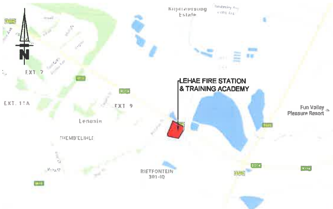
Figure 1: Locality of the Site

The site for the development consist of erven 6207 and 6208 in Lehae Extension 1. The north-eastern boundary of the site is the R554/Nirvana Drive and the north-western boundary is Arcturus Street.