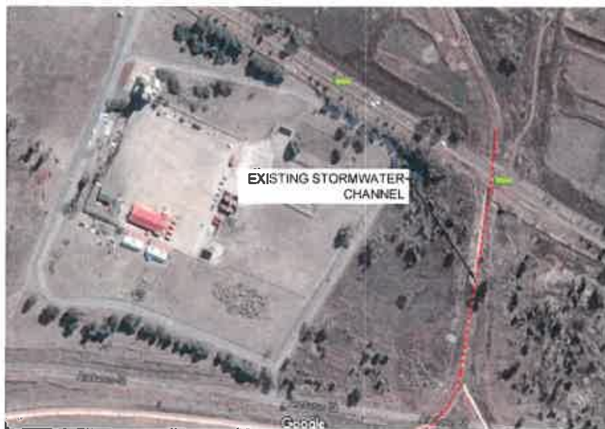
Figure 4: Existing Stormwater Channel

The site drains in a north-eastern direction. Special attention must be given to the accommodation of stormwater in dolomitic areas. There is an existing stormwater channel on the eastern side of erf 6206, which crosses the R554. It may be possible to drain the site to this channel but further investigation in terms of run-off calculations and the capacity of the channel is required.